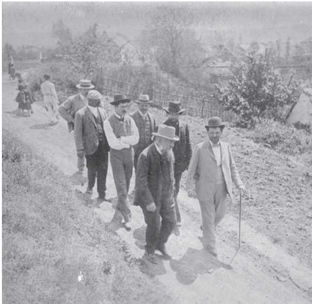
4 / Auguste Rodin visiting the village of Hroznová Lhota in 1902, 1902