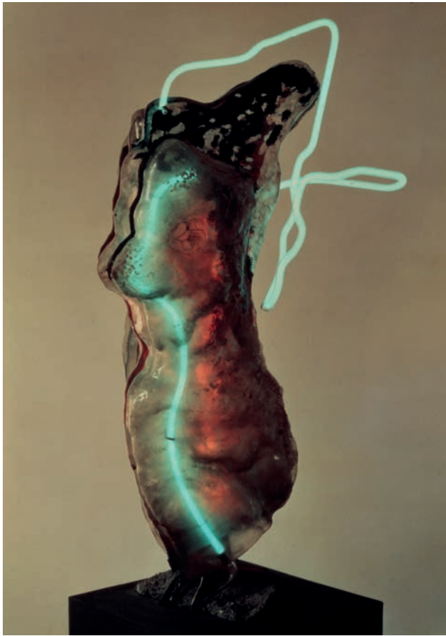
7 / Zdeněk Pešánek, Male and Female Torso, 1936 plastic, paint, neon tube, stone, light bulb, electrical wiring, 136 × 64 × 39 cm National Gallery Prague

lights, cannot be fitted easily into any of those pre-existing categories, and clearly demand an alternative. However, such emphasis on incommensurability would inadvertently add to the process of marginalisation, producing an atomised picture of modernism deprived of any basis for meaningful comparison. It would also imply a questionable view of cultures as hermetically sealed, which no serious cultural theorist or historian would endorse. Pragmatically, it is unlikely that art historians are going to be persuaded to jettison the idea of Czech Cubism, Expressionism or Impressionism, if only because of the heuristic purposes they serve. In addition, as the American philosopher Kendall Walton suggested, aesthetic judgements depend on categories: we can only perceive something as an artwork if we have a prior sense of the kind of thing it is. 85 Nevertheless, embracing such artists and foregrounding the problems of categorisation they raise may be an important strategy to adopt, especially if its ability to impinge on and problematise the ready-made categories of western modernist art history writing can be explored and amplified. One model for this approach can be found in the 'associative art history' of the Czech art historian Tomáš Pospiszyl. 86 Pospiszyl takes the work of prominent Czech and Slovak artists of the post-1945 era that, at first sight, indicates the influence of contemporary ideas of