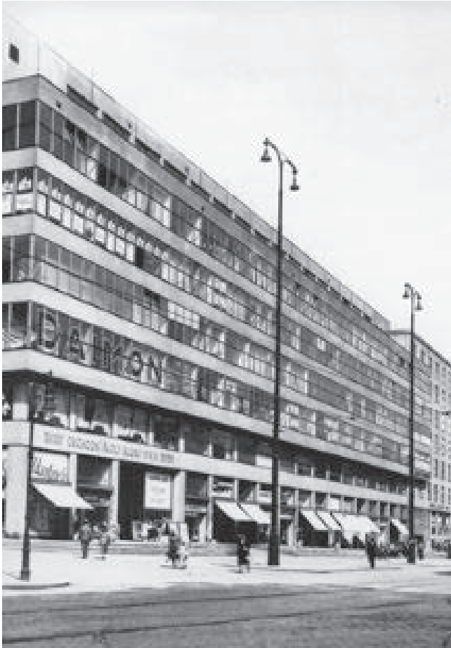
1 / Josef Fuchs – Oldřich Tyl, Prague, The Trade Fair Palace, 1925–1928 Archival photography – V. Gotsche, around 1940 Prague City Archives, Collection of Photographs, sign. I 9661 Photo: Prague City Archives

Modernist and avant-garde magazines have increasingly become a major subject of study, and they have been used to strengthen the claims regarding the operations of networks. 29 Publications such as Volné směry and ReD in Czechoslovakia, the Hungarian journals MA and Munka , Zdrój based in Poznań or the Romanian Contimporanul , acted as important conduits for the international exchange of ideas and dissemination of artworks across borders. A more detailed reading of the publications, however, reveals familiar asymmetries. While magazines in Poland, Czechoslovakia, Yugoslavia and Romania, for example, were full of translations of texts by French and German authors, this enthusiasm was seldom reciprocated.